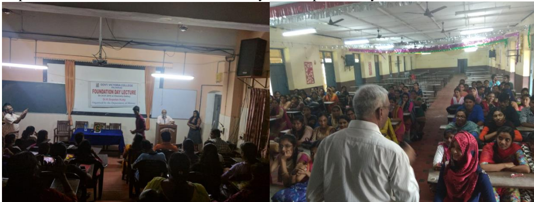
Foundation day celebrations- 2019

Ozone day Celebration: Conducted awareness programme by Environment Club. Nature club of our college observed World Environment Day 5th June, World population Day 11th July by the Department of Economics. World Ozone Day 16th September by Bhoomithrasena Club.