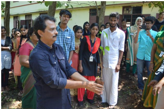
BIRDS CLUB INAUGURATION

Decided to monitor curricular dissemination through Lecture series, Invited lectures, international / National Seminars, Workshops, Quiz, Debates, Group discussions, Exhibition and Celebration of National Days of significance.