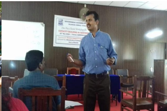
CAPACITY BUILDING FOR TEACHERS

Executed the organization of National seminars, workshops, lecture series, quizzes, debates etc. by different departments and clubs at the institution